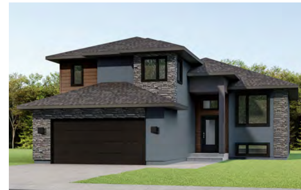
CAB OVER PLAN